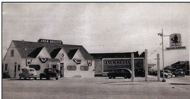
Jack Kelly's Chicken in the Rough, 1948