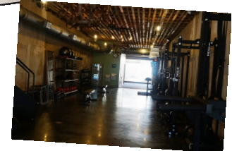
Man Made Fitness

Wellness Program: Combines proper and balanced nutrition with increased physical activity to promote changes in your lifestyle, optimizing overall health and wellbeing. Programs can be goal or time specific.