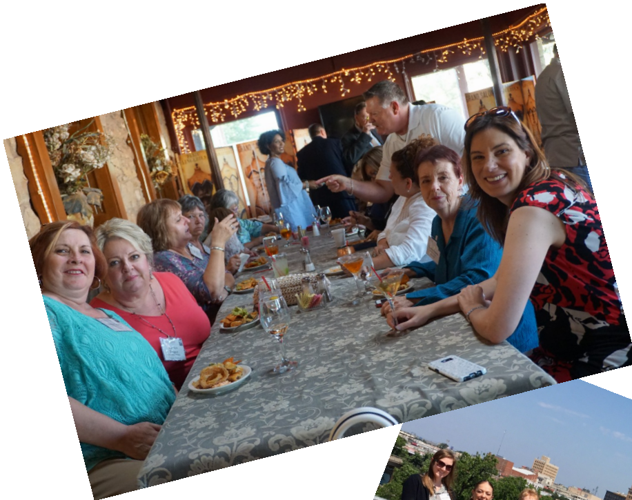
Conference attendees gathered at a reception at Ms. Hattie's Café & Saloon Restaurant and were provided tours of Ms. Hattie's Bordello Museum. The Concho Cowboy Company made an "Old West" presentation to the group.