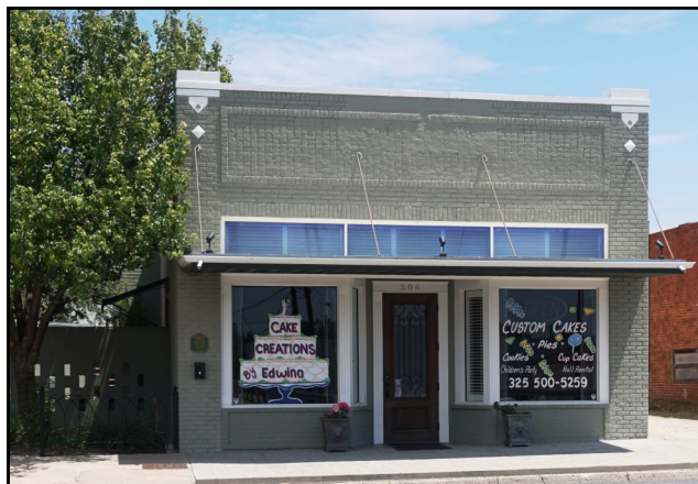
Cake Creations by Edwina, 506 S. Chadbourne 2017