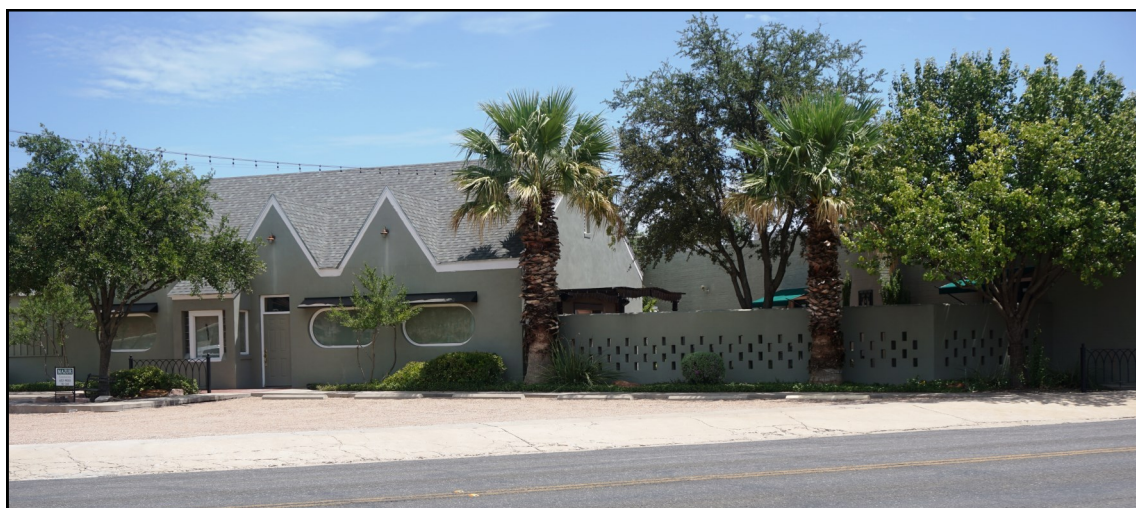
TODAY: The Three Gables, 502 South Chadbourne