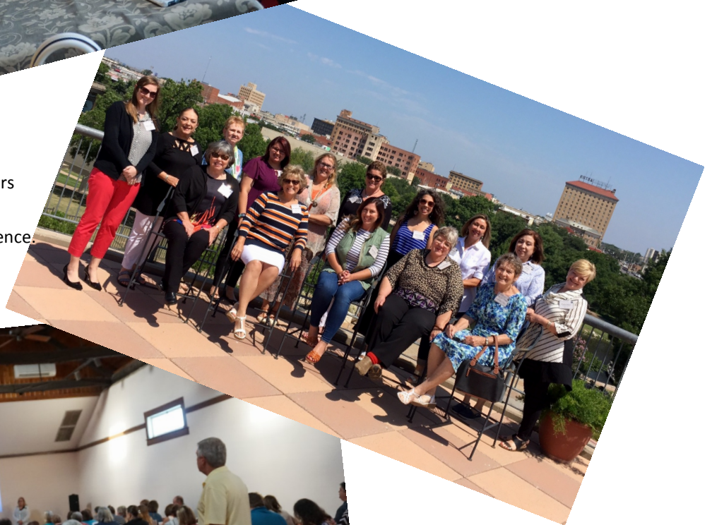
Training for new Main Street managers along with time for photographs was offered on the first day of the conference.