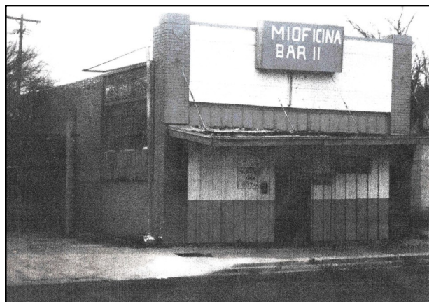
Mi Oficina Bar II, 506 South Chadbourne 2000