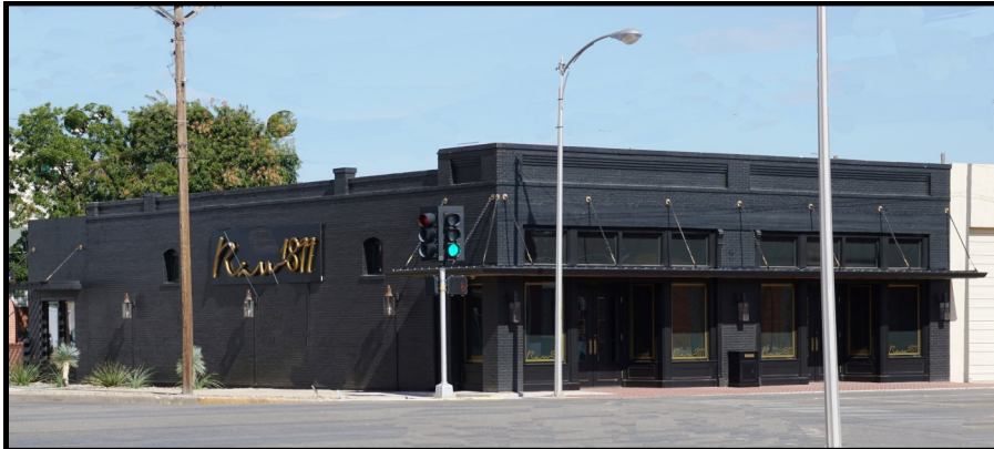
Raw 1899, 502 N. Chadbourne Art * Wine * Beer * Lounge

someone with a vision. David states that when it comes to bringing old structures back to life, “I can’t get it out of my system”.