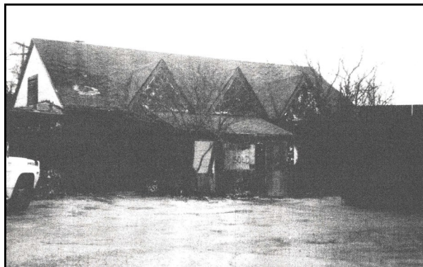
Three Gables, 2000