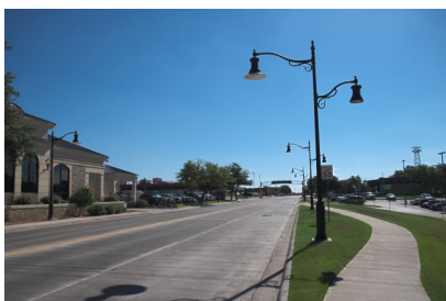
Concho Avenue streetlighting

Again, DSA is extremely grateful to have received grant funding and private donations to make this project possible. Institutions such as the San Angelo Health Foundation, the San Angelo YMCA, First Financial Bank, and the San Angelo Area Foundation serve as leaders within our community.