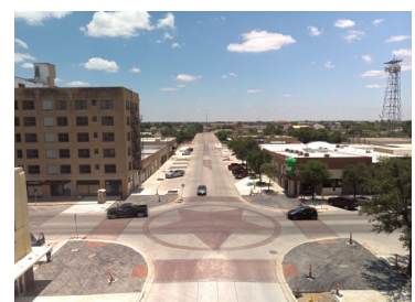
Chadbourne Streetscape Design

The new street redesign will make the streets safer and more accessible to pedestrians. The sidewalks are spacious and ADA compliant. This will allow for more foot traffic and bring increased patronage to businesses in the surrounding area.