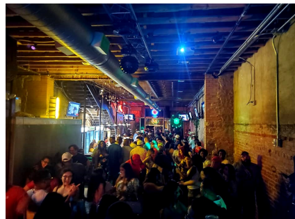
Night life inside Chadbourne Tavern