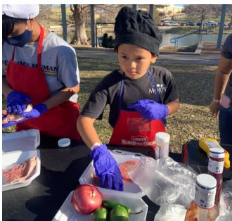
Top: GFAFB Marine Corp Volunteers pose for a photo