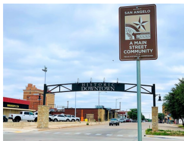
Historic Downtown gateway