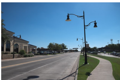
Concho Avenue streetlighting

Again, DSA is extremely grateful to have received grant funding and private donations to make this project possible. Institutions such as the San Angelo Health Foundation, the San Angelo YMCA, First Financial Bank, and the San Angelo Area Foundation serve as leaders within our community.