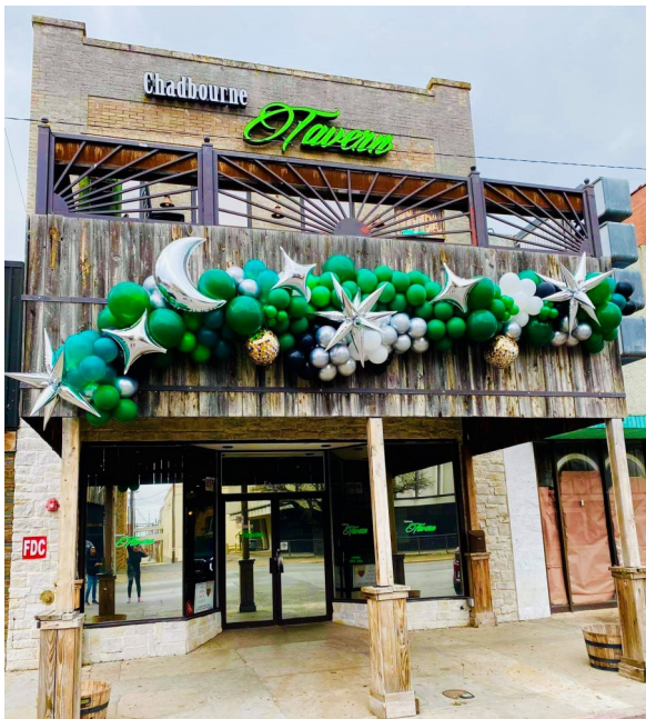
Facade of Chadbourne Tavern, 115 S. Chadbourne St

Throughout the years, Chadbourne Tavern has continued to stay innovative by incorporating theme nights, drink specials, and will soon execute plans to take the business to the "next level". Follow Chadbourne Tavern on Facebook to stay up to date with promotions and special events.