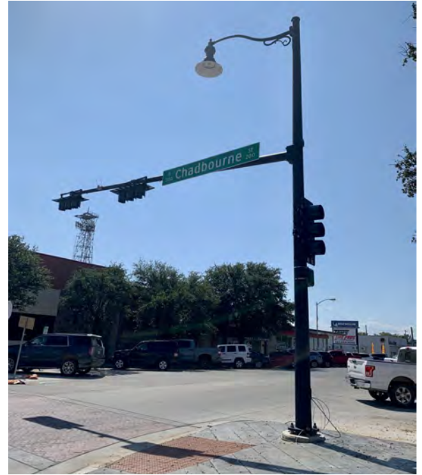
Above: Traffic lights located at each corner of Chadbourne St. intersections

Park benches and trash receptacles can be seen across from 19-Thirty Three Whiskey Bar, San Angelo Lifestyles, and Plateau Brewing Co. Both of these additions to the streetscape design allow for a tidier and relaxing environment. Other touches of detail include streetscape railing, enhancing the overall appearance of downtown.