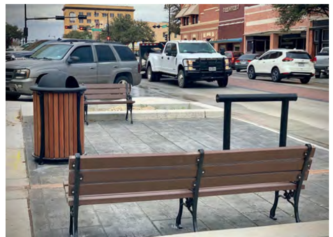
New benches and trash dispensers along South Chadbourne St.