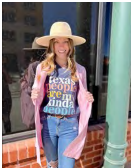
Myers Boutique: https://myersboutique.com/