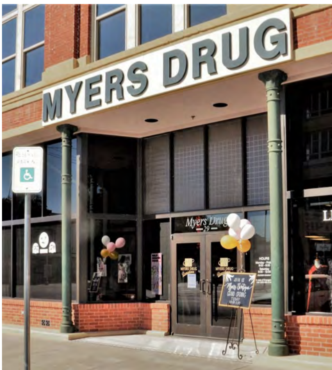
Facade of Myers Drug & Boutique, 29 S. Chadbourne St

Myers Drug Store is also home to Myers Boutique. Shop a fresh, new line of clothing, accessories, and gifts.