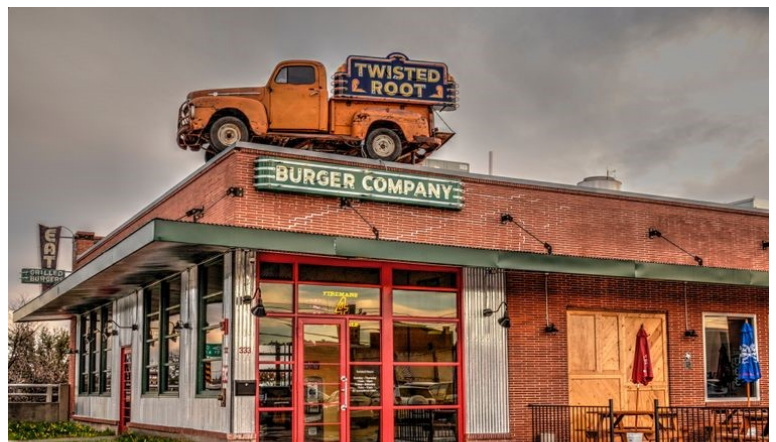
After photo of the renovated Twisted Root Burger Company