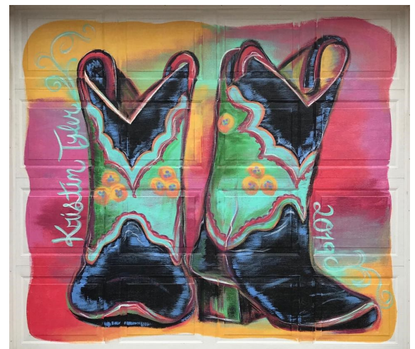
Bottom: Cowboy boot mural