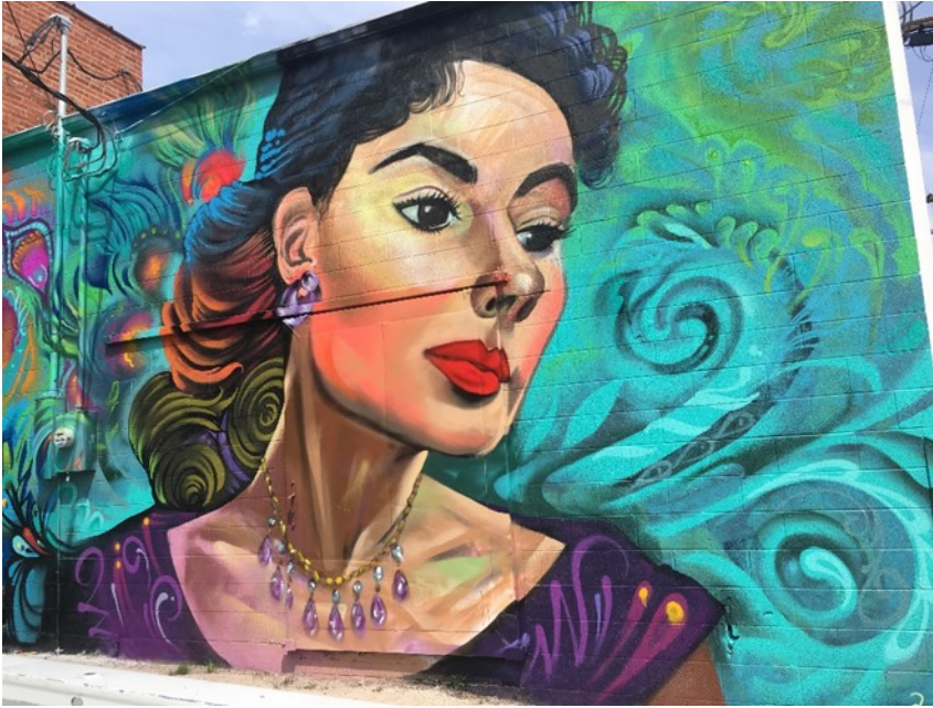
Mural in Paintbrush Alley of actress Elizabeth Taylor

A “Giant” step for art kind: Downtown San Angelo, Inc. and Art in Uncommon Places partner for an incredible new project- the revitalization of Paintbrush Alley. Nestled in the alleyway behind Firestone on W. Concho Ave. and Texas Theater on W. Twohig Ave., the outdoor gallery stretches along the back of several businesses. Bright murals and symbols of Texas culture encompass the alley’s theme of 1956 motion picture “Giant.” Adapted from the novel by Edna Ferber, life in West Texas is detailed in epic, Western drama style. The film features prominent actors like Rock Hudson, Elizabeth Taylor, and James Dean- each of whom are immortalized in this not-so-secret corner of San Angelo. On March 28, 2019, Art in Uncommon Places held a Paintbrush Alley Party open to the public to formally exhibit the space. The event featured live music, refreshments, and a formal ribbon cutting ceremony by the Chamber of Commerce’s Concho Cadre.