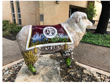
"Miss Tam Ewe-university"

Sponsored by Texas A&M AgriLife Research and Extension Center