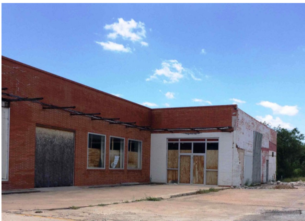
Before photo of the building Twisted Root now occupies