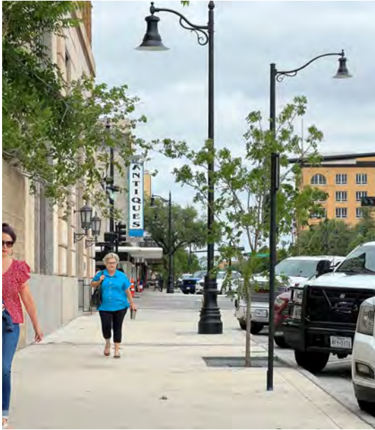
Above: New historic style street lighting.