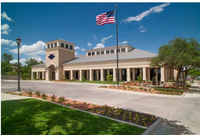
Façade of First Financial Bank, 222 S. Koenigheim