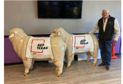
"AEP 1 & AEP 2" Sponsored by: AEP Artist: Raul Ruiz Located at 933 W 19th St