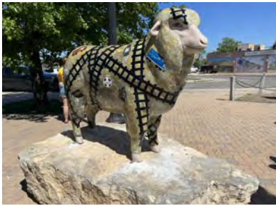
"San Angelokie" Sponsored by: Railway Museum of San Angelo Artist: Shaydee Watson Located at 703 S Chadbourne St