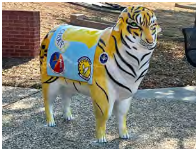
"Training Ewe" Sponsored by: Goodfellow Air Force Base 17th Training Squadron Artist: Jose Duran