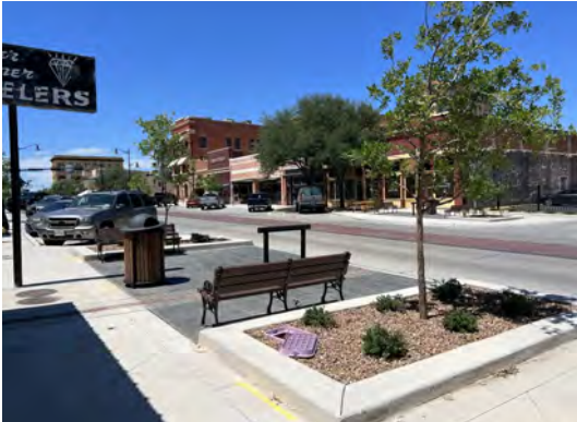
Above/Below: Plants and shrubs suitable for the 100 degree plus West Texas temperatures were selected for planter boxes. New trees have been planted in designated landscaping areas along Chadbourne Street.