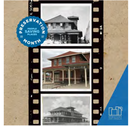
People Savings Places Highlights:

"Downtown San Angelo Inc. has made it their mission to promote the preservation of our past. The very past that shows our city's sense of brilliance and creativity. Downtown San Angelo consists of 51 properties containing historical attributes and significant architectural design. These structures are connections to our past reminding us of our great city's ingenuity and progression towards our future."