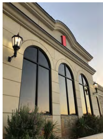
First Financial Bank: https://ffin.com/