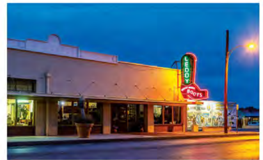
M. L. Leddy's, in San Angelo, on April 19, 2022.